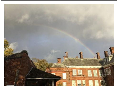
The children were very excited to see a rainbow on their way back from a walk