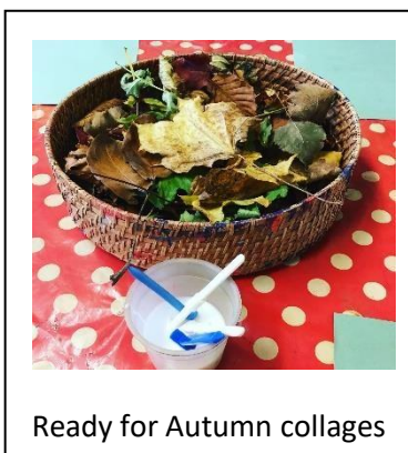
Ready for Autumn collages