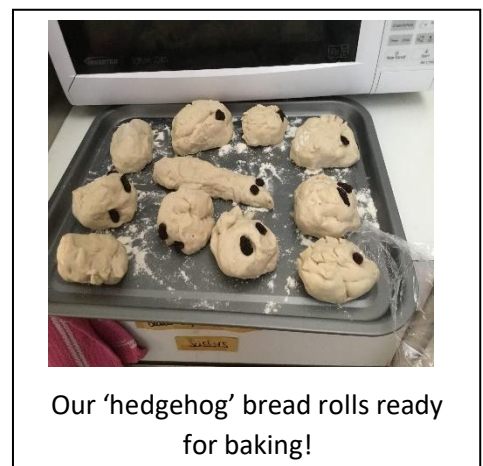
Our 'hedgehog' bread rolls ready for baking!