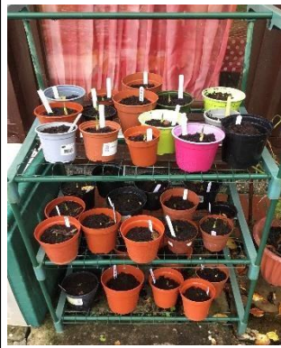
The daffodils are growing already!