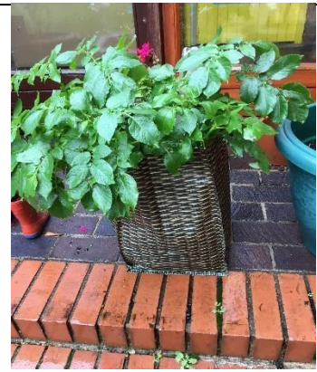
Our 'Christmas' potatoes have grown so much!